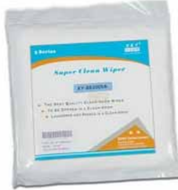
Micro Denier Cleanroom Wipes

XY-881009 XY-881709 XY-881309 XY-881809 XY-881008S XY-881909 XY-881609