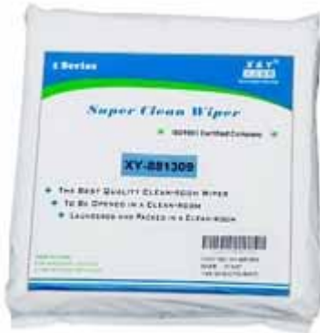
Cleanroom Polyester Wiper

XY-881009 XY-881709 XY-881309 XY-881809 XY-881008S XY-881909 XY-881609