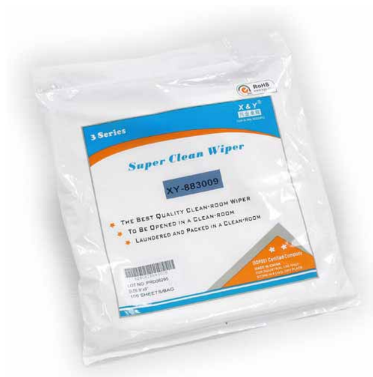
Micro Denier Cleanroom Wiper