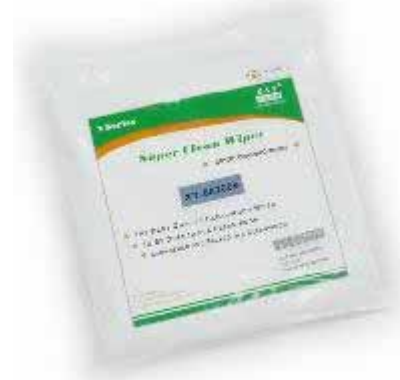
Submicro Denier Cleanroom Wiper