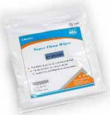
Micro Denier Cleanroom Wiper

XY-883009 XY-884209 XY-883109 XY-884009 XY-884109