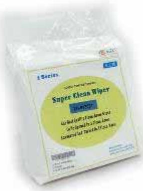
ZH Series Cleanroom Wiper

XY-883009 XY-884209 XY-883109 XY-884009 XY-884109