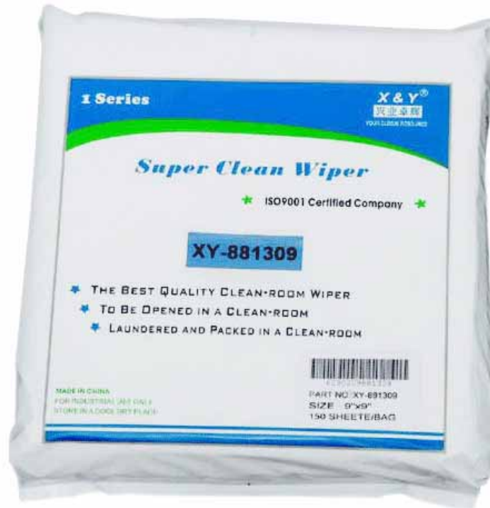
Cleanroom Polyester Wiper